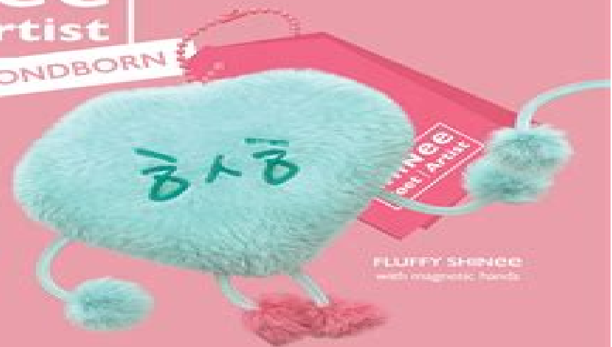
FLUFFY SHINEe with magnetic hands