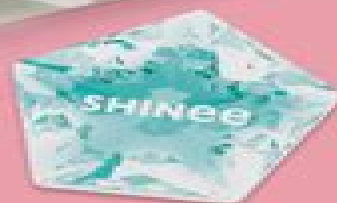
MUSIC NFC CARD 25 x 24 (mm)