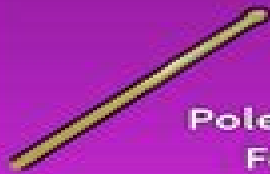
Pole (1st Form)