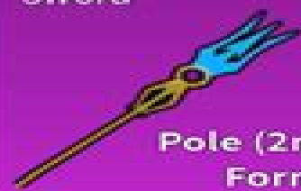
Pole (2nd Form)