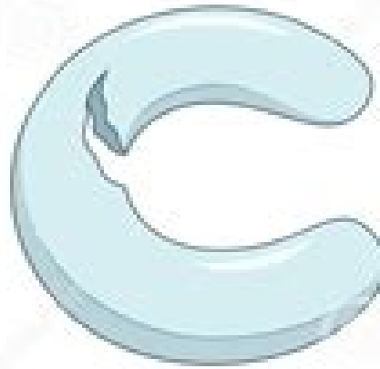
Parrot beak tear