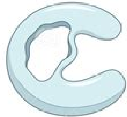
Bucket Handle Tear