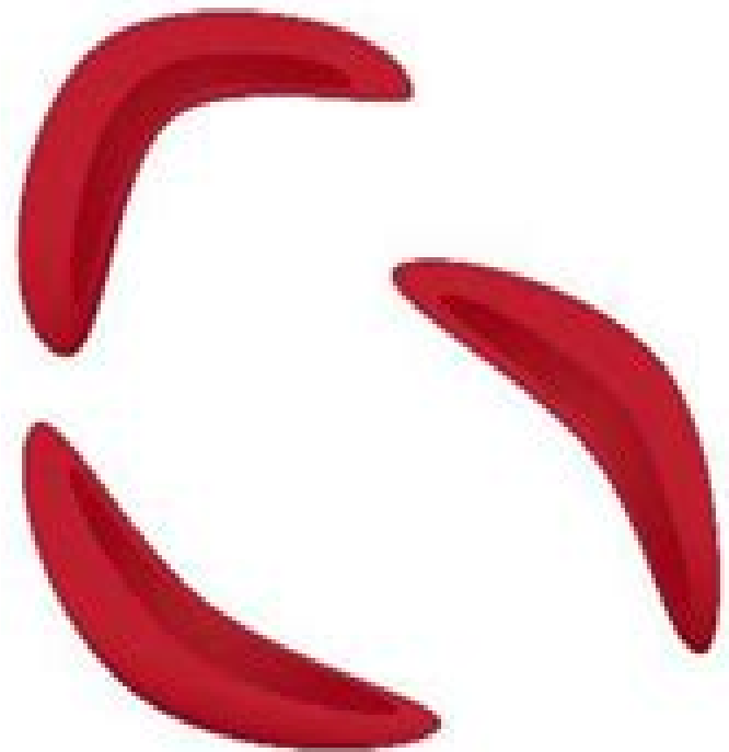
SICKLED RED BLOOD CELLS