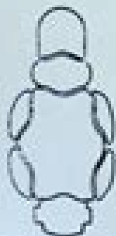
Fig. 10. Section Plan of the Church of Santa Maria della Spina, Florence. (Reproduced from the author's book, "The Architecture of Brunelleschi.")

1. "Unfinished" vaults Unfinished vaults are present in the third phase but there is no feeling that those of the second phase were already very difficult to understand, for they were still basically simple because their components were forms of lower variety. In the third phase even the components of uncompleted vaults are very difficult to explain because they are elliptical or circular shapes that are sometimes not even the products of