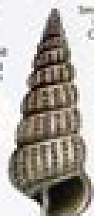
California Horn Snail (CAS)

Conus californicus To 1.5 in. (4 cm) high Smooth brownish shell has a low spine. A carnivorous species that preys on prey with a harpoon-like tooth that injects poison. Do not handle live specimens.