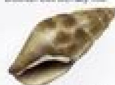
Carinate Downshell (W)

Comptosia parvula To 4.5 in. (11 cm) Yellow-white to brownish shell has raised ribs but lacks long spines. Faint brown spots on outer lip of shell.