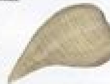
Common Fig Shell (CR)

Hamaxys solitaria To .75 in. (2 cm) Very fragile white to pinkish shell has a delicate lip. Shells are so light they are often transported to the highest tide line.