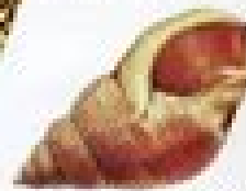
Channeled Nassia (CA)

Junonia johnstoni To 3 in. (7.5 cm) Deep water Gulf Coast shell only reaches up on shore after storms occur. Alabama's state shell.