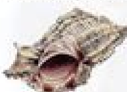
Apple Murex (CR)

Murex alpinus To 1 in. (2.5 cm) Elatebrate shell with white to brownish shell with long ribs.