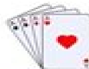
Playing with cards