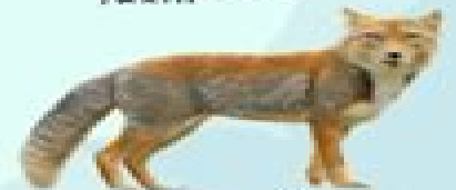
Tibetan Sand fox