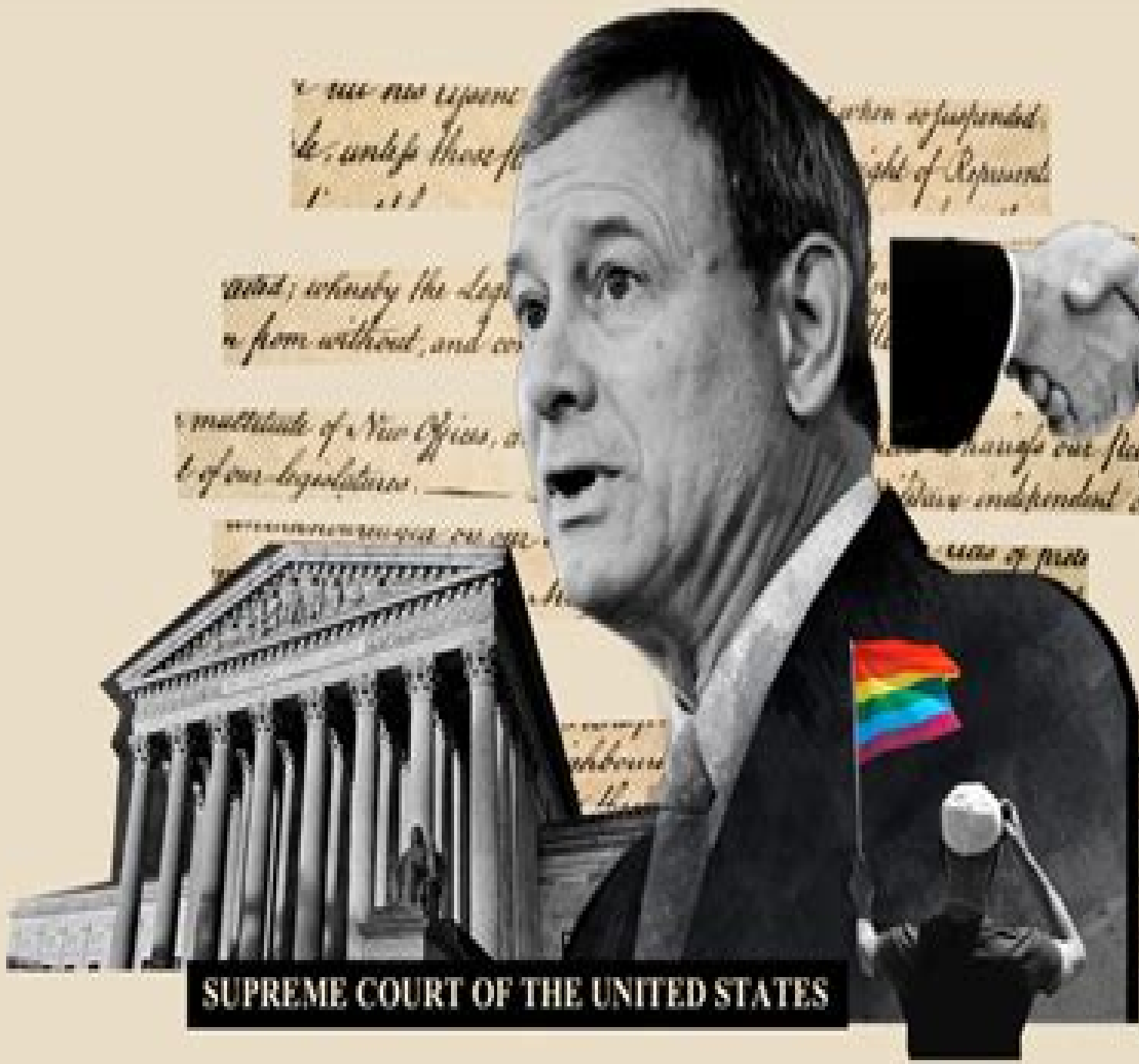
SUPREME COURT OF THE UNITED STATES