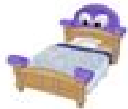
Monster Head Bed