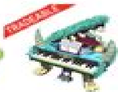
Monster Piano (Tradeable)