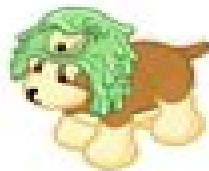
Swamp Monster Costume Cap