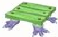
Creepy Monster Table