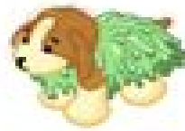
Swamp Monster Costume Suit