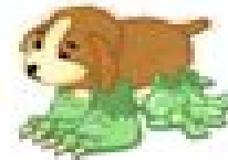
Swamp Monster Fake Feet