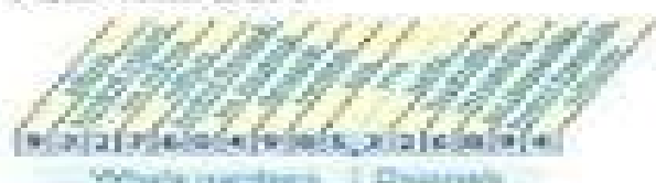
Place Value Chart

EXAMPLE: The number 12.45 is a decimal. It would be read as "twelve and forty-five hundredths."