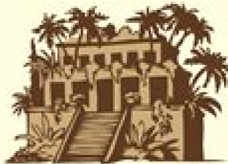
Hanging Gardens of Babylon