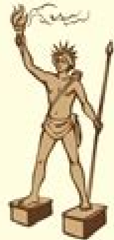
Colossus of Rhodes