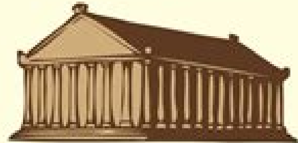
Temple of Artemis at Ephesus