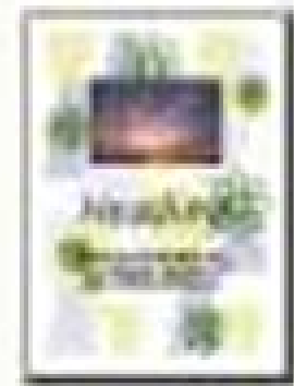
Basic Quick Publication