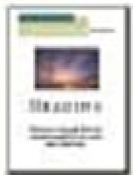
New Quick Publication