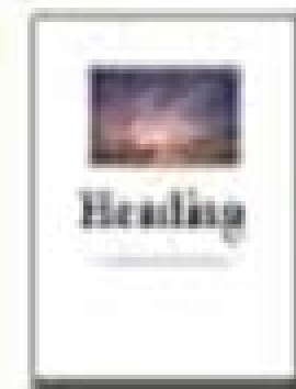
Book Quick Publication