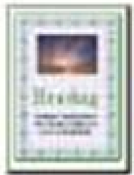
Simple Quick Publication