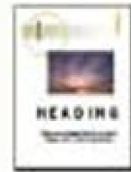
New Quick Publication