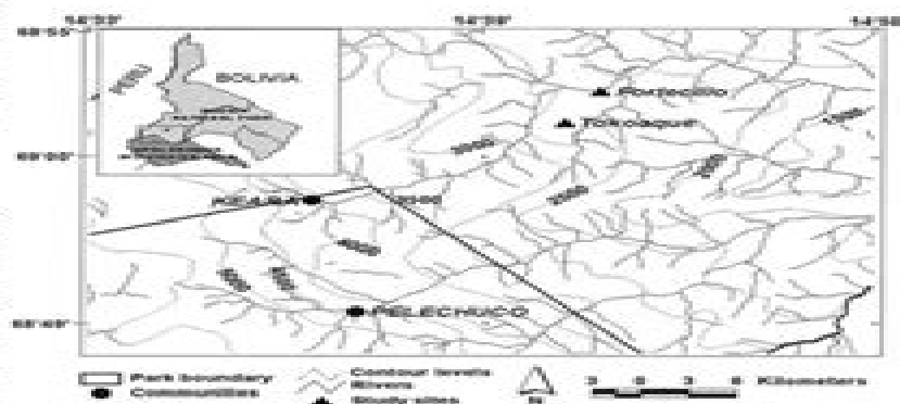
Figure 1. Map of the western Yungas forest, dpto. La Paz, in Madidi National Park showing the location of Tokoaque and Fortecillo.

Each morning, we surveyed different points at least 200 m apart 11 arriving before sunrise and sound-recording the dawn chorus for 15 minutes. Thereafter, we surveyed different trails, covering 1–3 km, and often pausing our work between 12h00 and 15h00. Studies were conducted using binoculars, sound-recorders and five pre-recorded reference tapes. Birds were observed, sound-recorded and identifications verified by use of pre-recorded tapes or playback, including rebound playback (broadcasting the first response to playback). For rapid assessment surveys, bird vocalisations are the best evidence to verify identification 11 . We tried to tape-record all species at least once. Each evening we completed a checklist