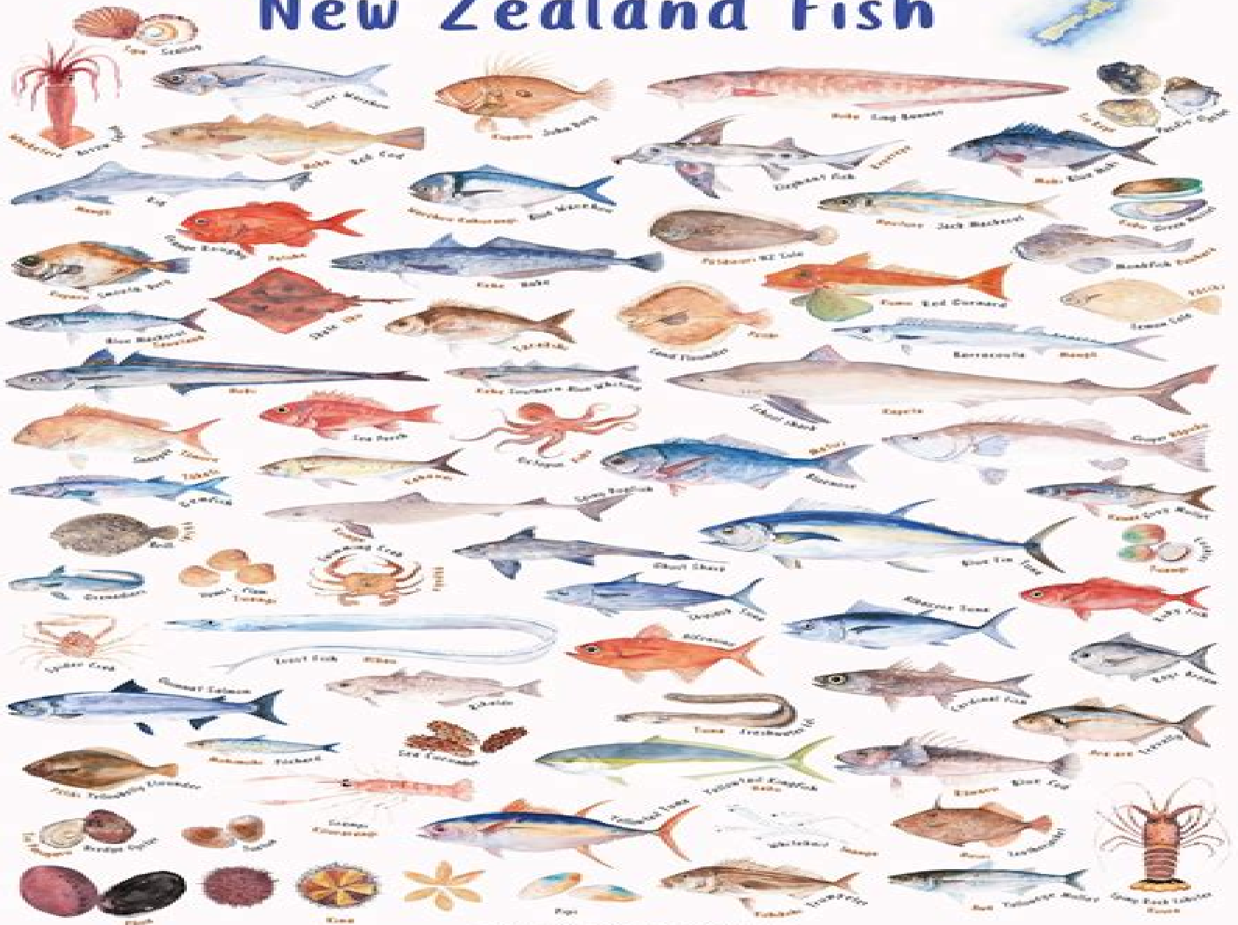
Drawing & Design by Shaka Art