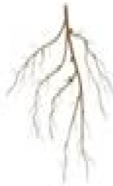
Roots (with nodules)