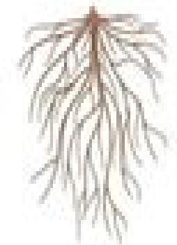
Roots (fibrous) 1