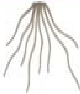
Roots (onion, fibrous)