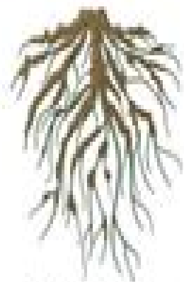
Fibrous roots (with soil)