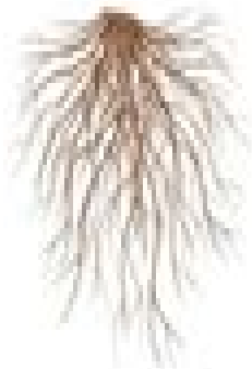
Roots (fibrous) 2