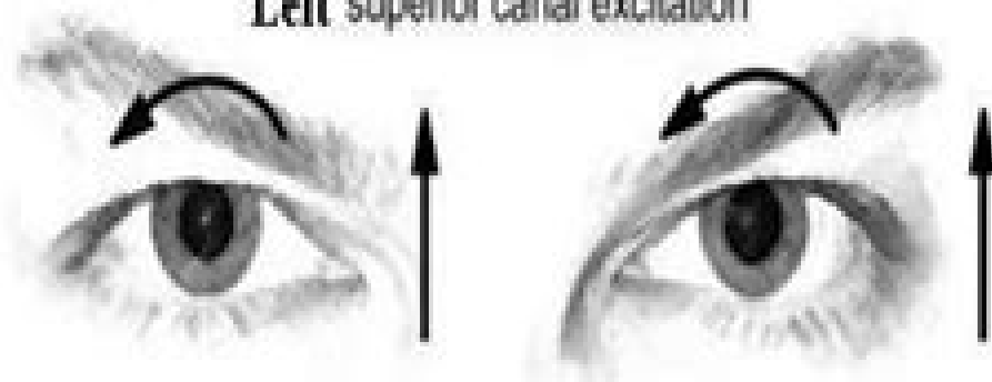
Left superior canal excitation