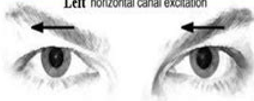
Left horizontal canal excitation