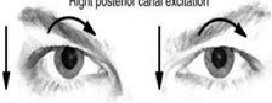
Right posterior canal excitation