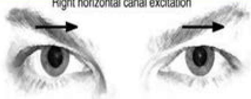
Right horizontal canal excitation