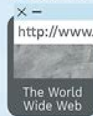
The World Wide Web