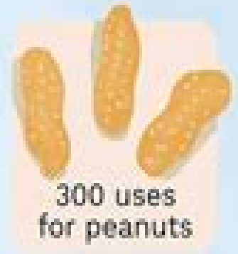
300 uses for peanuts