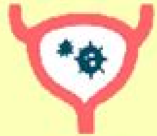
Urinary Tract Infections