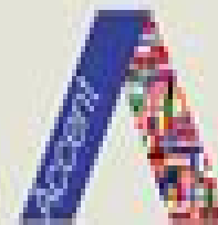
Acorn Software International