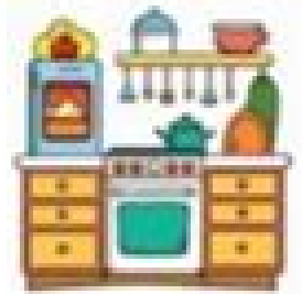
in the kitchen