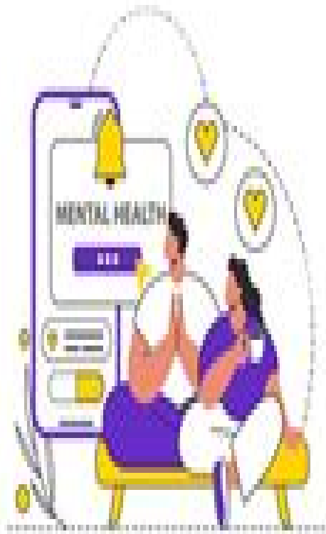
Mental health support