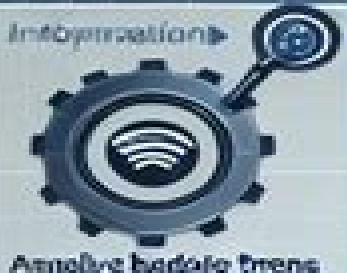
Analyze budget trends