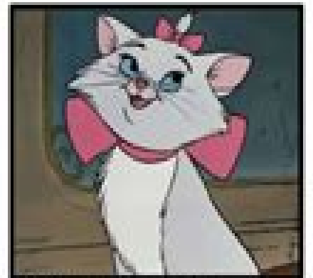
Goliath the Chihuahua