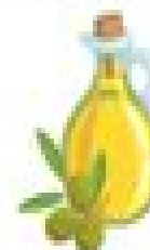
Olives & Olive Oil