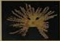
Starburst, 1987, by J. M. W. Turner