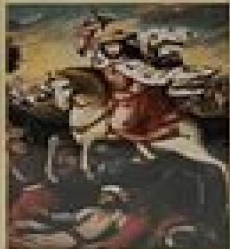
Scene of Triumph, 1812, by Jacques-Louis David