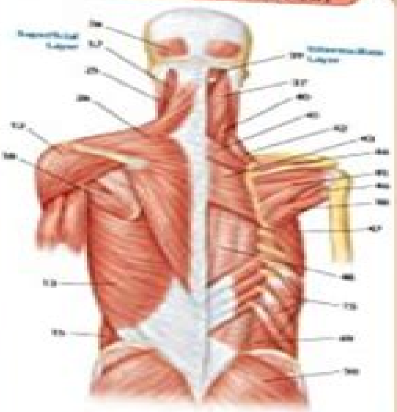
FIGURE 2. MUSCLES OF THE HEAD & NECK (POSTERIOR VIEW)