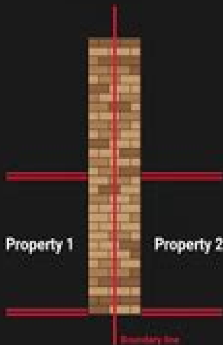
Party wall type A