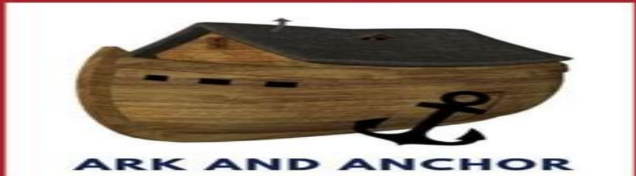
ARK AND ANCHOR