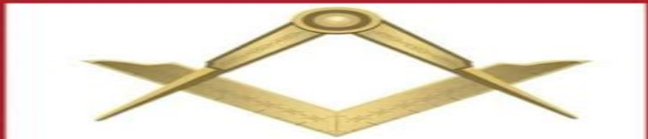
SQUARE AND COMPASS