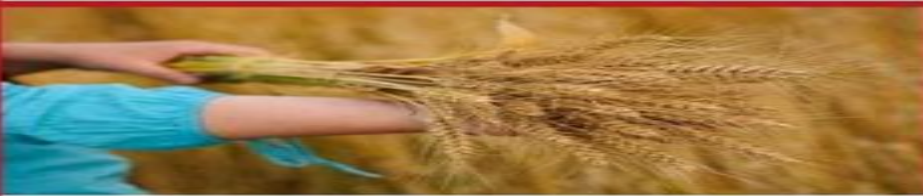
SHEAF OF CORN