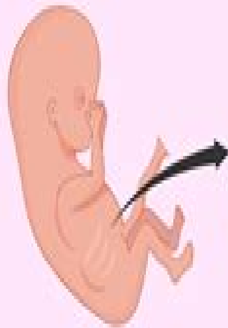
Indifferentiated sexual system of the fetus