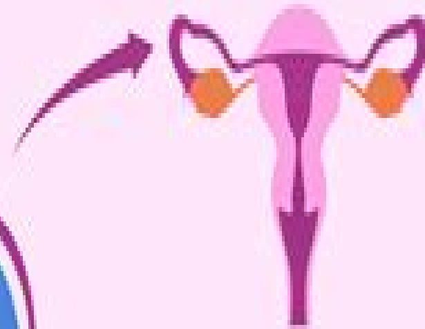
Developed female reproductive system