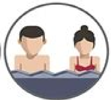
IN THE POOL