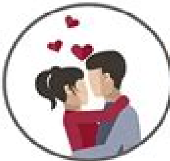
WITH A KISS