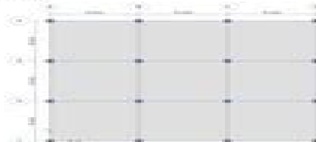
Fig 4: Plan of the RC Building

From Figure 3 it shows, the structures whose time period is between 0.7-2 sec. and lies in soil type III, NBC 105:1994 gives higher design horizontal seismic coefficient than of IS 1893:2016.