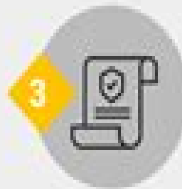
Security policies and procedures