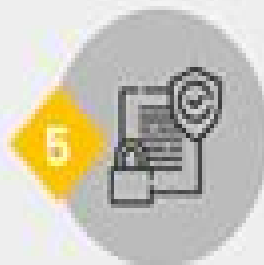
Security testing and auditing skills