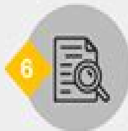
Attention to detail