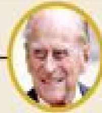
Prince Philip (Died 2021)