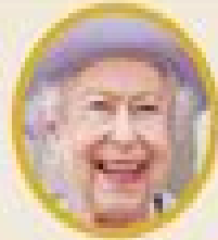
Queen Elizabeth II (Died 2022)