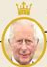
King Charles III