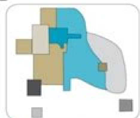
Multiple nuclei model

Land use is arranged in wedges or sectors which radiate from the city centre. Growth follows a linear pattern along major transport routes or physical features such as river valleys. We assume that once a particular type of land use establishes itself in an area, it attracts similar activities (like industry) and repels dissimilar ones (like high-status housing).