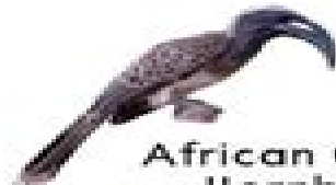
African Grey Hornbill