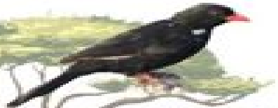
Red-billed Buffalo Weaver