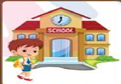
GOING TO SCHOOL