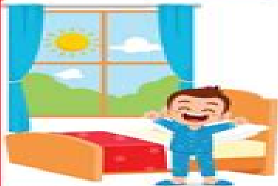
EARLY TO RISE