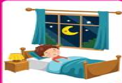
EARLY TO BED