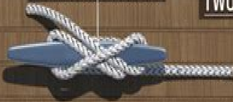
CLEAT HITCH KNOT