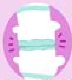
Degenerative Disc Disease