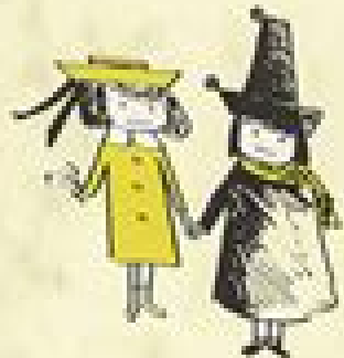
This is MADELINE AND THE BAD HAT