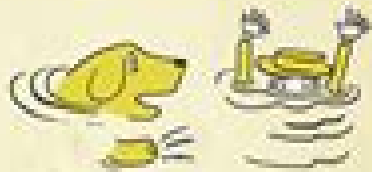
This is MADELINE'S RESCUE