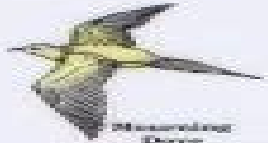
Broad-winged Hawk Buteo borealis 17"