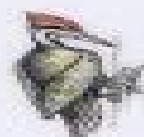
Broad-winged Hawk Buteo borealis 17"