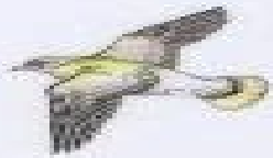
Barn Swallow Hirundo lunifrons 12"