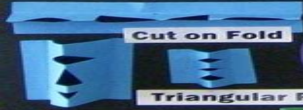
Cut on Fold