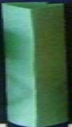
Slits & Slots