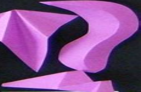
Score & Fold