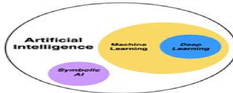
Fig. 1: Venn Diagram

Artificial Intelligence, or AI, is the result of our efforts to automate tasks normally performed by humans, such as image pattern recognition, document classification, or a computerized chess rival.