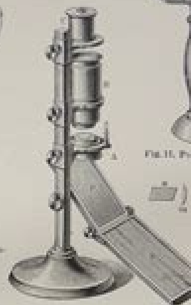
Fig. 10. Mikroskopischer Polarisationsapparat von Steinberg.