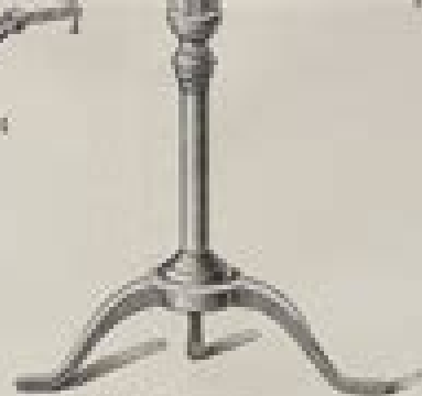
Fig. 8. Spectrometer von Schell.