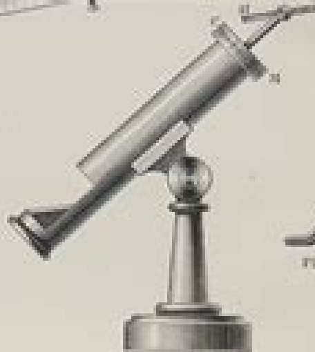
Fig. 7. Polarisationsapparat von Biot.