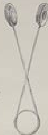
Fig. 9. Terebinth.