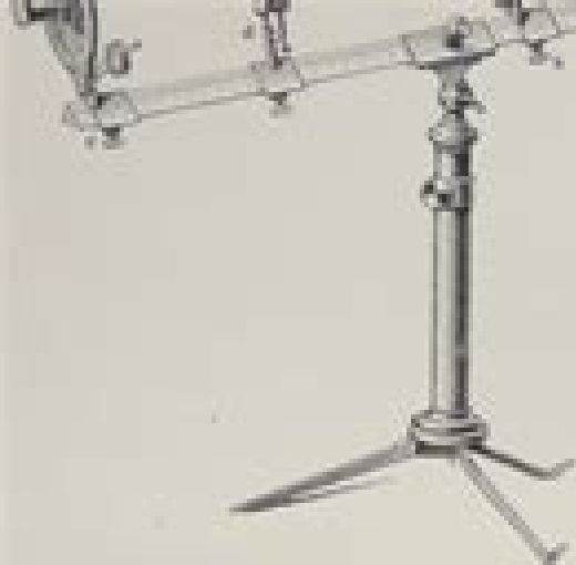
Fig. 6. Polarisationsapparat von Dove.