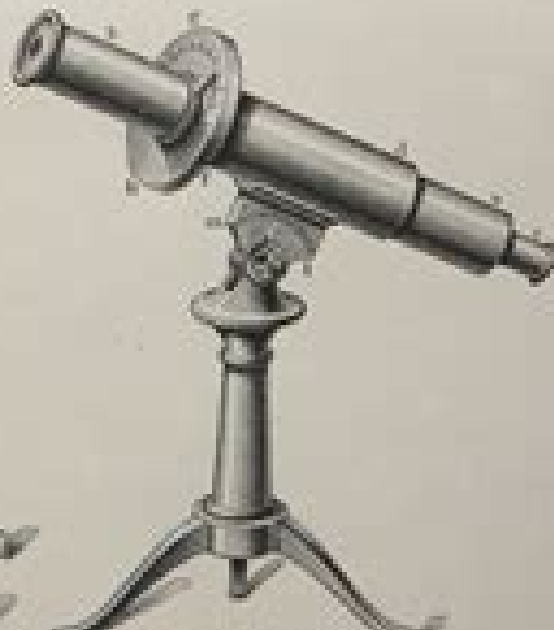
Fig. 14. Polaroid von Wollaston.