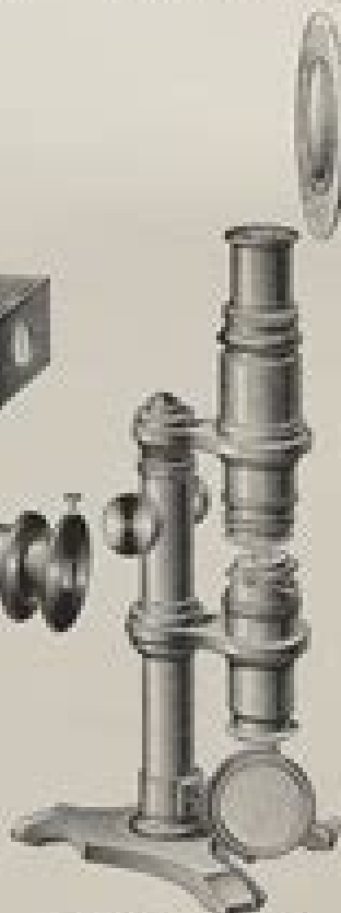
Fig. 12. Mikroskopischer Polarisationsapparat von Heilmann.