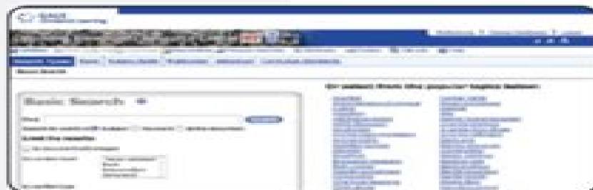
The interface is easy to use.