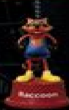
Mr. Raccoon Charm