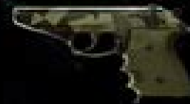
S&S M232 Weapon Skin: Apocalypse