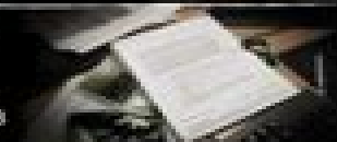
Files: Letters from 1998