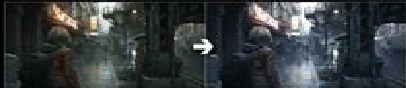
Screen Filter: Apocalypse