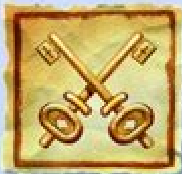
Penance and Reconciliation