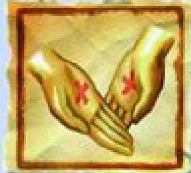
Anointing of the Sick