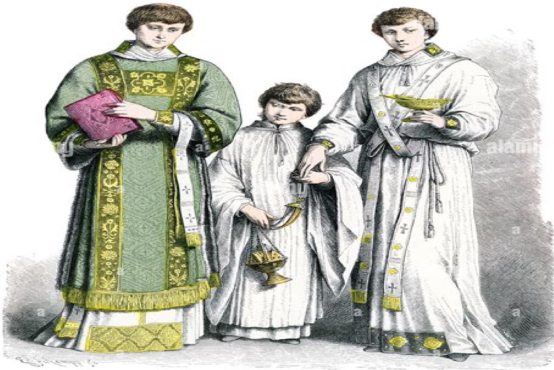
Diakon mit der Dalmatica und Alba.