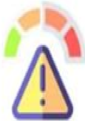
Perceive Potential Risk