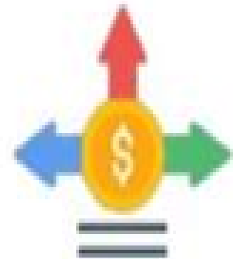
Associated with a Particular Investment