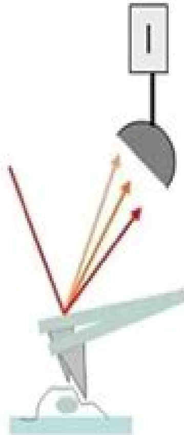
Atomic Force Microscopy (AFM)